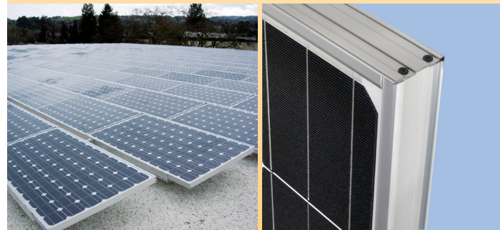
The NU-U245P1 offers industry-leading performance for a variety of applications.

156 mm pseudo-square monocrystalline solar cells provide high power output. Ideal for large commercial rooftops where space is a premium.