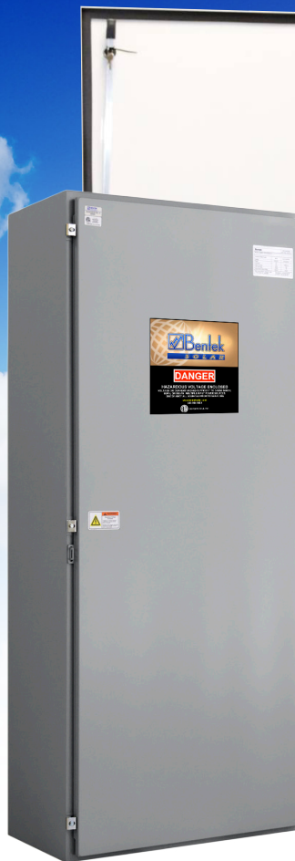
250kw-650kw Recombiner Circuit Breaker