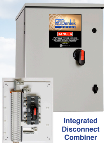
Integrated Disconnect Combiner