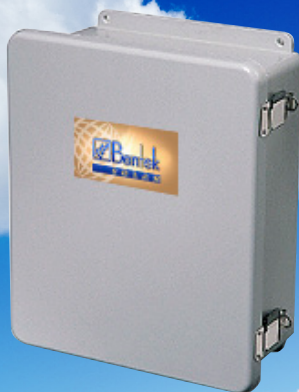
Bi-Polar Array Combiner