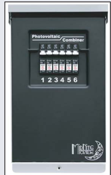
Configured for 150VDC Breakers (Offgrid)