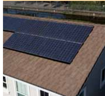
Black frame improves aesthetics for residential roof top applications.

This module uses an advanced solar cell surface texturing process to increase light absorption and improve efficiency.