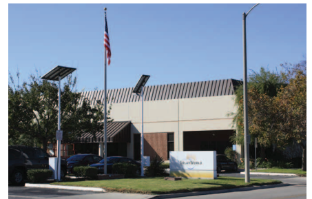
Module assembly and sales center for the Americas - Camarillo, CA