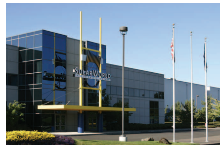
Crystal growing, wafering and cell production - Hillsboro, OR