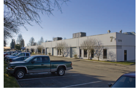
Silicon reprocessing - Vancouver, WA