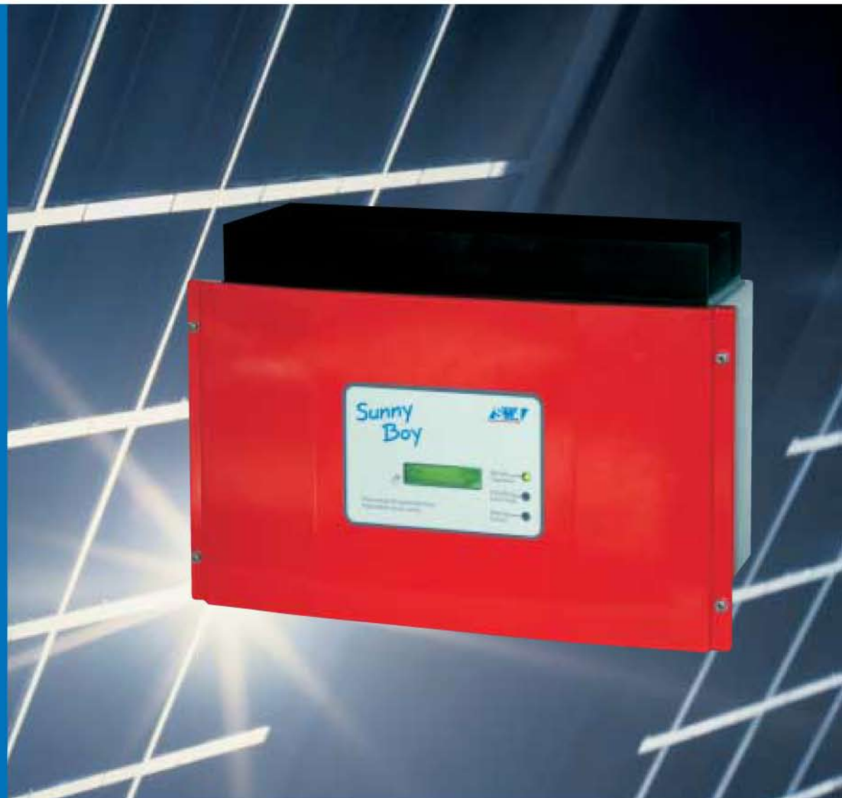
Shown with optional display

The SMA Sunny Boy inverter, the most popular grid-tied photovoltaic inverter in Europe, is now UL 1741 Listed and available in North America. Sunny Boy's extensive track record in some of the world's most demanding markets has made it the favorite among PV professionals everywhere. Over 200,000 Sunny Boy inverters have been installed worldwide. Having achieved the highest reliability of any PV inverter, Sunny Boy gained immediate acceptance in the US and Canadian markets. Superior design, rock-solid German engineering, and exceptional real-world efficiency have made Sunny Boy the top choice for American solar designers. These professionals know that Sunny Boy is a grid-tied inverter that they can recommend without reservation and install with confidence.